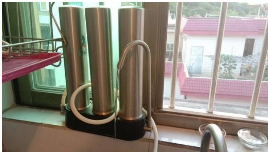
Three stages (ceramic, activated carbon, ceramic+silver) tap water filter.

If you live in a big city or an industrial place, your tap water is probably dead and so poisonous that it is not suitable for drinking or bathing. Using water bought in plastic containers is not a healthy solution either. Filtering water with properly constructed filter is relatively simple and efficient solution.